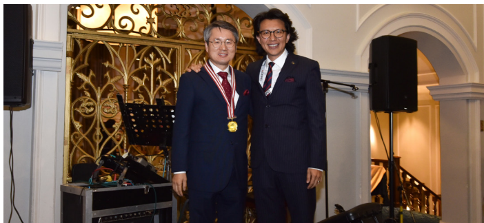
16th (2018-2020) EXCO Members of AAAD